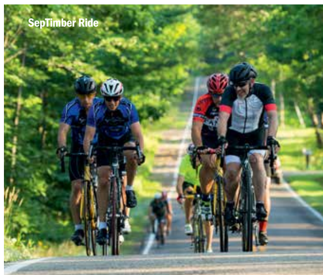
EAGLE RIVER CHAMBER OF COMMERCE