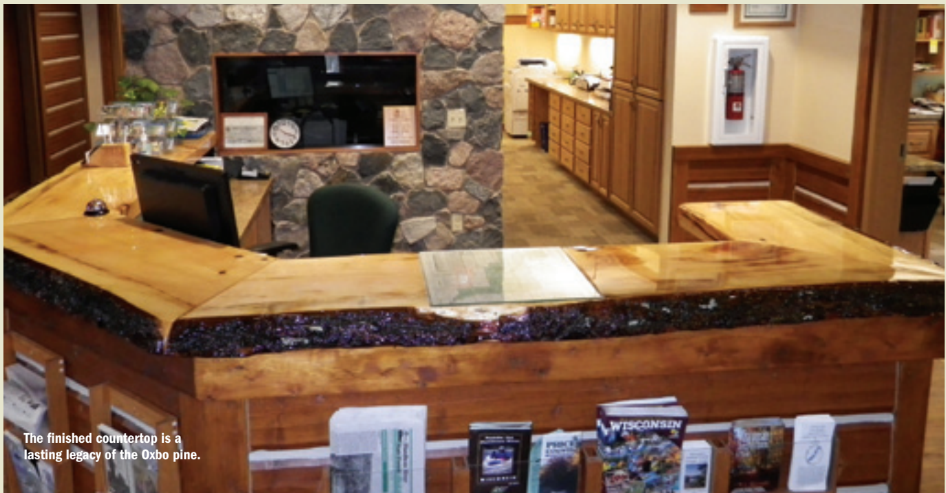
The finished countertop is a lasting legacy of the Oxbo pine.