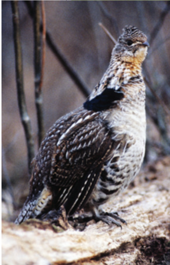
The ruffed grouse is the most common grouse species found in Wisconsin. It gets its name from the dark-colored neck ruff found on both males and females.

The ruffed grouse ( Bonasa umbellus ) is a chicken-sized bird that is shy and wary, spending the majority of its life alone and hiding from predators, according to Gary Zimmer of the Ruffed Grouse Society. The ruffed grouse is the only grouse in North America from the genus Bonasa with its closest relatives being the Eurasian hazel grouse and the black-breasted hazel grouse of China. The ruffed grouse gets its name from the dark-colored neck ruff found on both males and females, though it is much more pronounced on the males. Three other members of the grouse family (but from a different genus) found in Wisconsin include the greater prairie chicken, sharp-tailed grouse and spruce grouse.