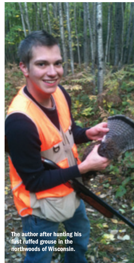
The author after hunting his first ruffed grouse in the northwoods of Wisconsin.

I asked myself why it took so long for my first bird. Eventually, I found the answer, but it wasn't what I expected. I realized there was no set timeline for learning how to hunt, and success isn't defined by the number of birds you bag in a day. The hunting part is only a piece of the greater whole. The excitement, the adrenaline and the gunfire don't overshadow the many joys found