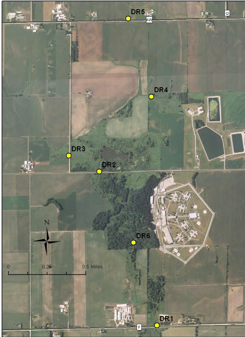
Figure 1 Location of Sampling Points