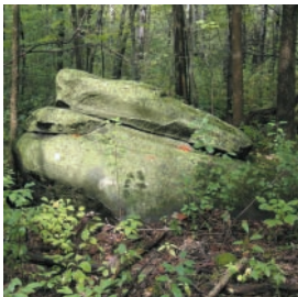
Rock Creek Trail View