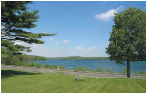
View from Flagstad Farm