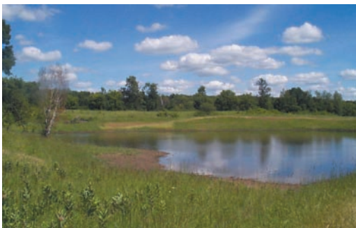
Dry Creek Sediment Basin