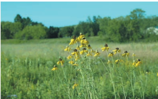
Rock Creek Prairie