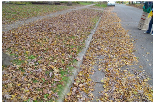
Figure 2: Level of leaf accumulation triggering start of collection in addition to street cleaning