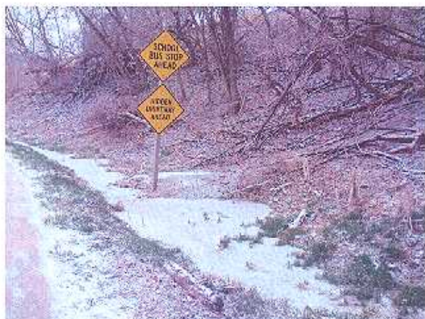
Figure 3. Manure pooled in roadside ditch on north side of Jaszewski lane, looking west. There was also a discharge of concrete down the hillside into the roadside ditch (Helsel).