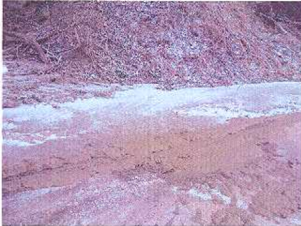
Figure 5. Manure pooled on roadway (Helsel)