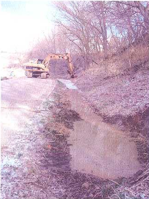
Figure 6. Excavator working to remove frozen and solid portions of manure from roadside ditch (Helsel)