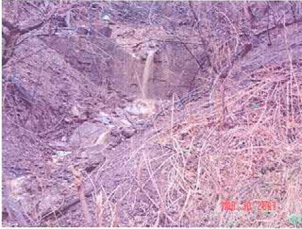
Figure 1. Photo of manure running down hillside on 3.30.07