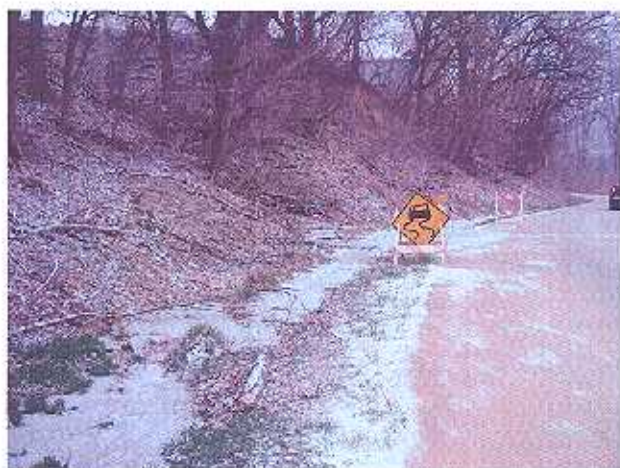
Figure 4. Manure pooled in roadside ditch on north side of Jaszewski land, looking east (Helsel).