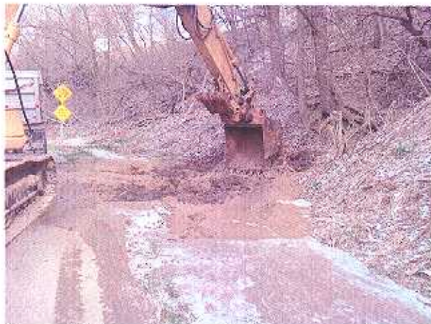
Figure 7. Excavator working to remove frozen and solid manure from areas where the manure was pooled on roadway