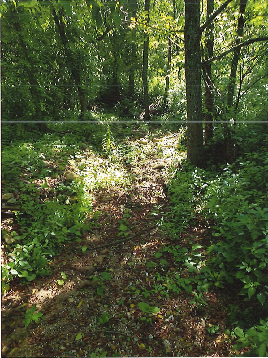
Figure 2. Photo taken on 08/11/2020 documenting unnamed tributary (WBIC: 3000381) as a dry run with intermittent flow during rain events.