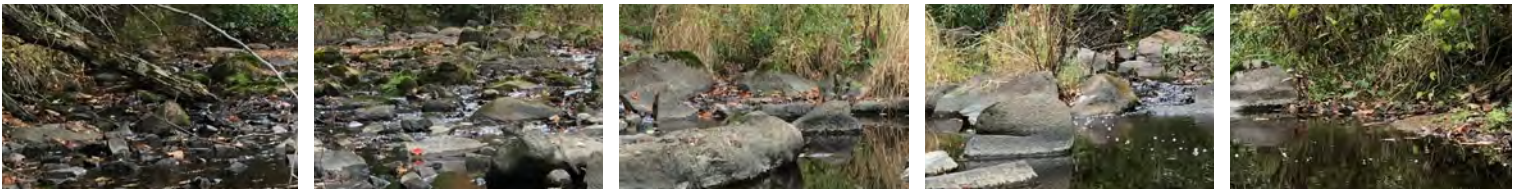
Monthly Phosphorus Concentration (mg/L)