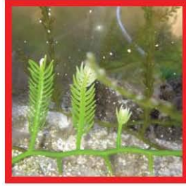
Killer algae ( Caulerpa taxifolia )