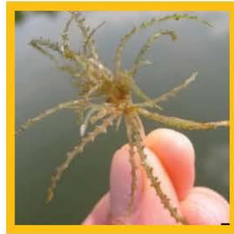
Spiny naiad ( Najas marina )