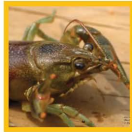
Rusty crayfish ( Orconectes rusticus )