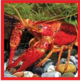
Red swamp crayfish ( Procambarus clarkii )