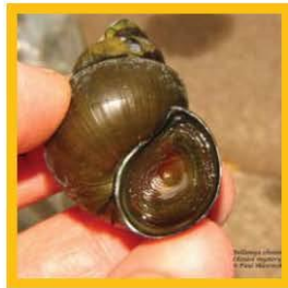
Chinese mystery snail ( Cipangopaludina chinensis )