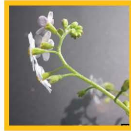
Aquatic forget-me-not ( Myriophyllum scorpioides )