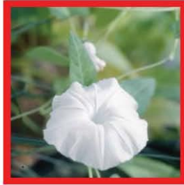
Water spinach ( Ipomoea aquatica )