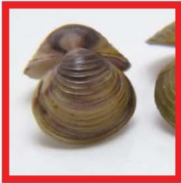
Asian clam ( Corbicula fluminea )