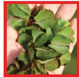
Giant salvinia ( Salvinia molesta )