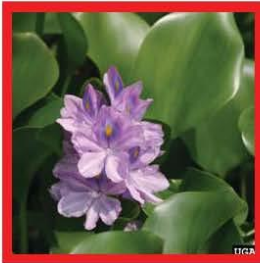
Floating water hyacinth ( Eichhornia crassipes )