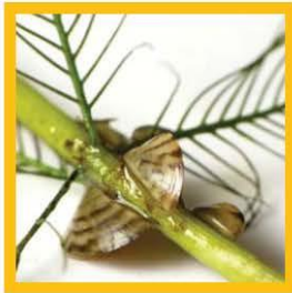
Zebra mussel ( Dreissena polymorpha )