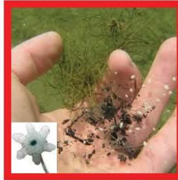
Starry stonewort ( Nitellopsis obtusa )