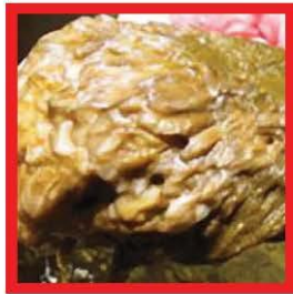
Didymo ( Didymosphenia geminata )