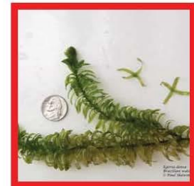
Brazilian waterweed ( Egeria densa )

Report any prohibited species as soon as possible by emailing: Invasive.Species@wi.gov . This publication does not list all the regulated species. For the full list of Prohibited or Restricted species please visit: www.dnr.wi.gov keyword: invasives