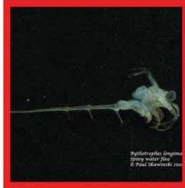
Spiny water flea ( Bythotrephes cederstroemi )