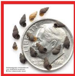
New Zealand mud snail ( Potamopyrgus antipodarum )