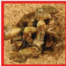
Quagga mussel ( Dreissena rostriformis )