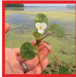
European frog-bit ( Hydrocharis morsus-ranae )