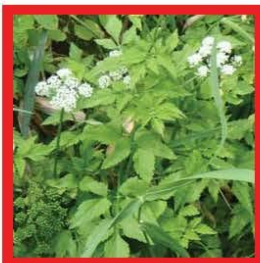
Java waterdropwort ( Oenanthe javanica )