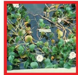
Anchored water hyacinth ( Eichhornia azurea )