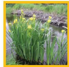
Yellow Iris ( Iris pseudacorus )