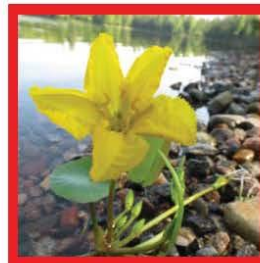
Yellow floating heart ( Nymphoides peltata )