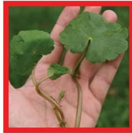
Floating marsh pennywort ( Hydrocotyle ranunculoides )