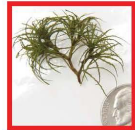
Brittle naiad ( Najas minor )