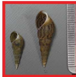
Malaysian trumpet snail ( Melanoides tuberculata )