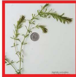
Hydrilla ( Hydrilla verticillata )