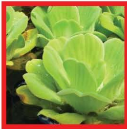
Water lettuce ( Pistia stratiotes )