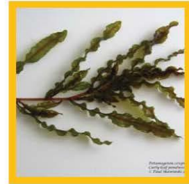
Curly-leaf pondweed ( Potamogeton crispus )