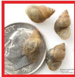
Faucet snail ( Bithynia tentaculata )