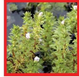
Asian marshweed (Limnophila sessiliflora)