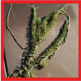
Indian swampweed (Myriophyllum polypersperma)