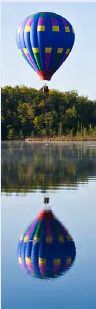
Mission Lake

The amount of nitrogen, phosphorus, and other nutrients determine a lake's trophic status. Lakes are classified as oligotrophic, mesotrophic, or eutrophic.