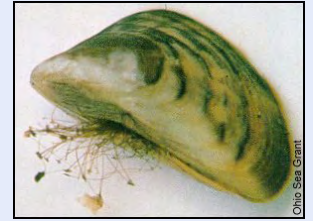
Zebra mussel Usually less than 1 inch

Information collected will be used to determine what, if any, invasive species control steps should be taken.