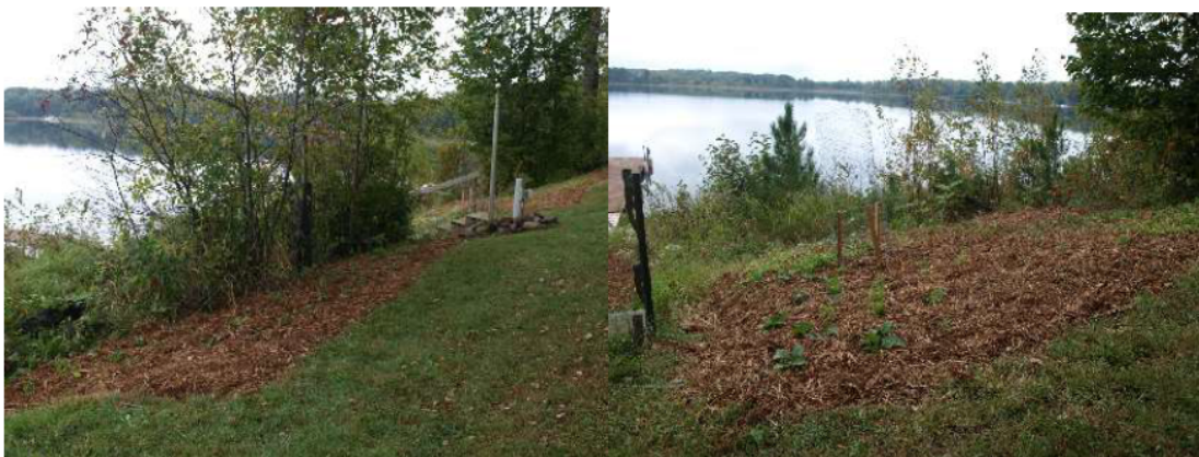
Figure 5: 2015 Hyllestad Shoreland Improvement Project – Native Plantings

Property owners were again approached about installing rain gardens and/or native plantings along the shores of Echo Lake. One property owner, Dick Hyllestad completed a shoreland inventory and small shoreland native planting based on recommendations made by The Green Frog shoreland consulting company. Figure 5 shows photos of the two small native plantings that were completed.