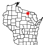
Project Location in Wisconsin

Map Date: Sept. 16, 2013 Filename: LoneStoneOneida_EWMPB_Sept13.mxd