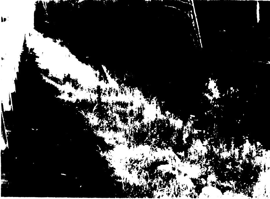
Purple Loosestrife at 6-mile Creek on July 20, 2006