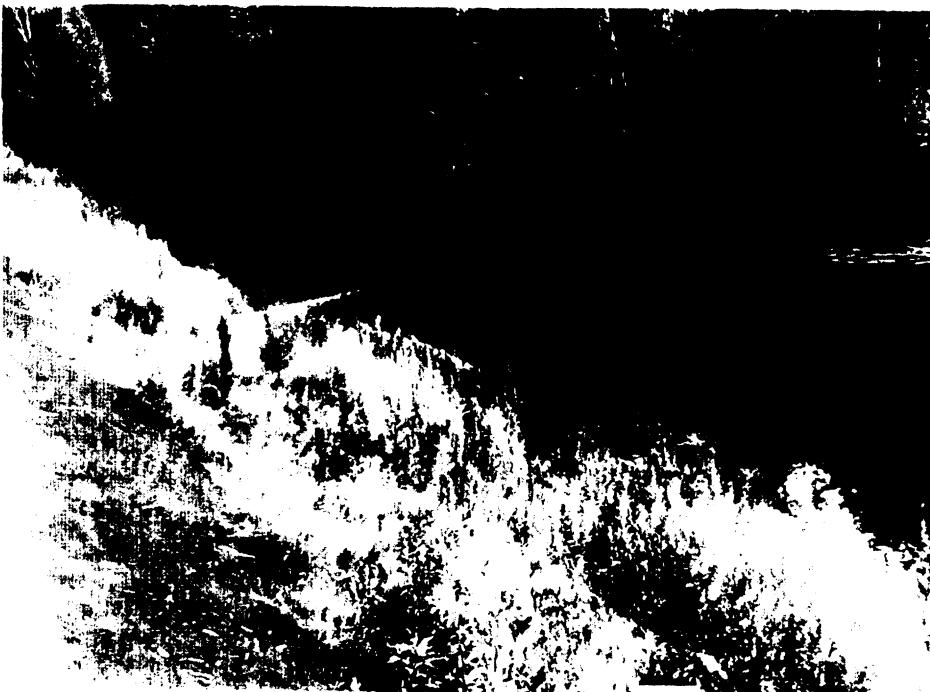
Purple Loosestrife at 6-mile Creek on August 31, 2006

File: 06-09-08 RAL FLPX 2006 Loosestrife Inv.doc