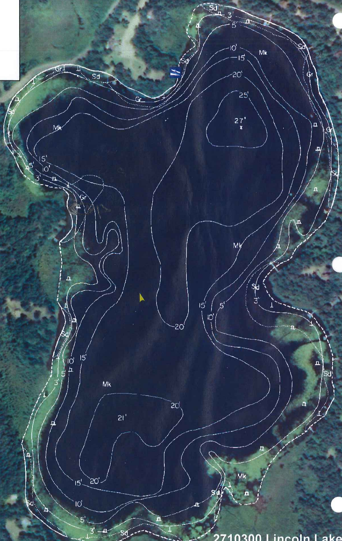
2710300 Lincoln Lake