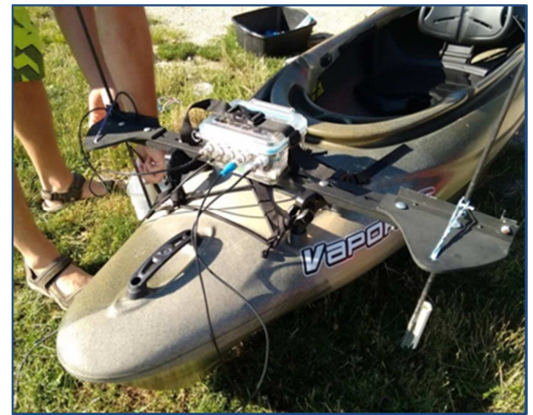
The water quality monitoring probe attached to a kayak, was developed, tested and calibrated at UW-Whitewater.