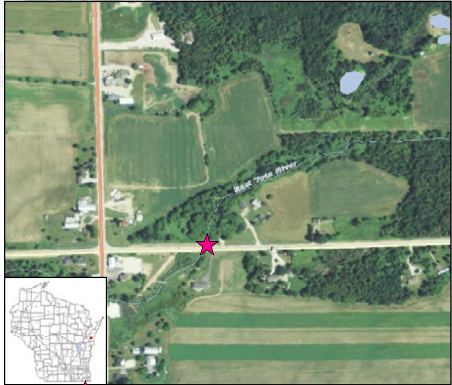
Map Legend ★ - Sampling Location for 2015