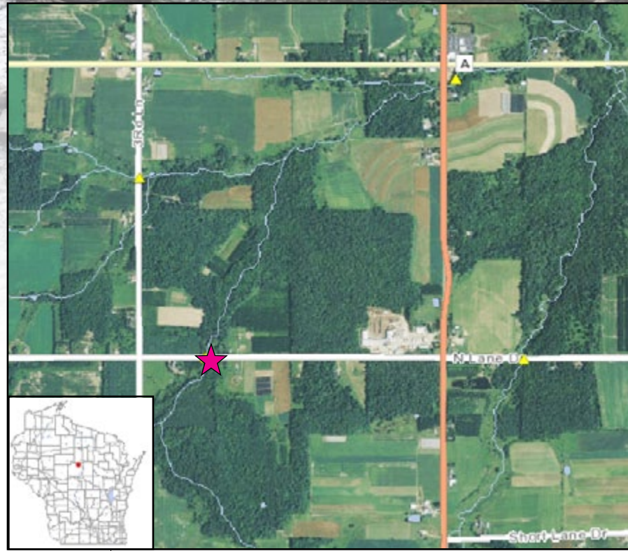
Map Legend - Sampling Location for 2015