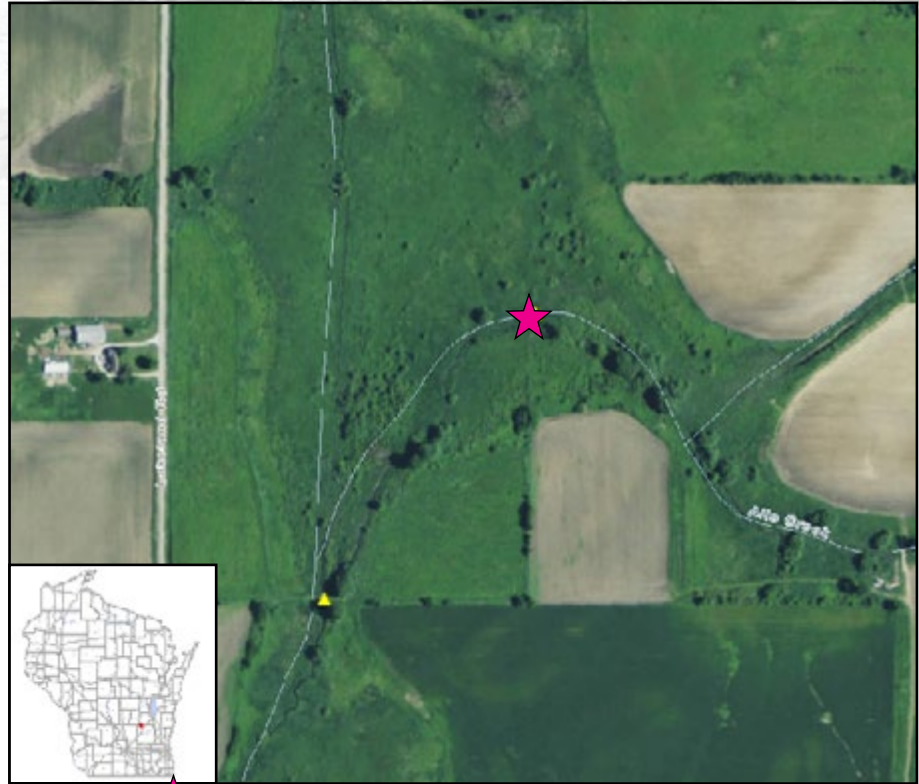
Map Legend ★ - Sampling Location for 2015