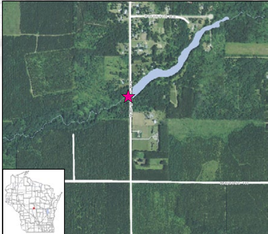
Map Legend ★ - Sampling Location for 2015