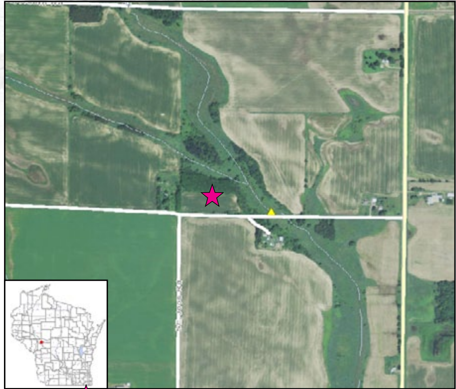
Map Legend ★ - Sampling Location for 2015