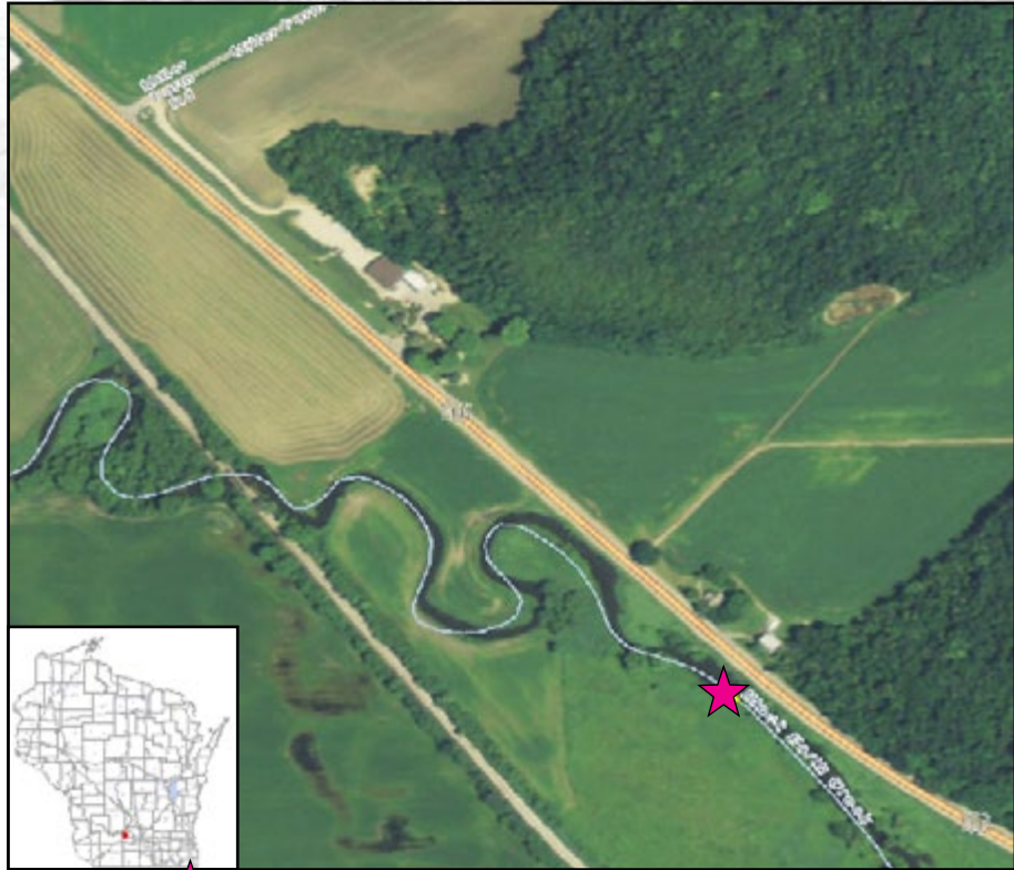
Map Legend ★ - Sampling Location for 2015