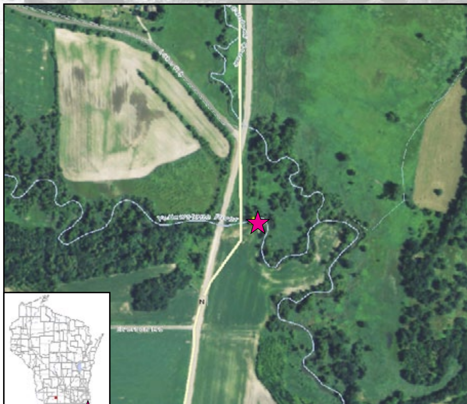
Map Legend ★ - Sampling Location for 2015