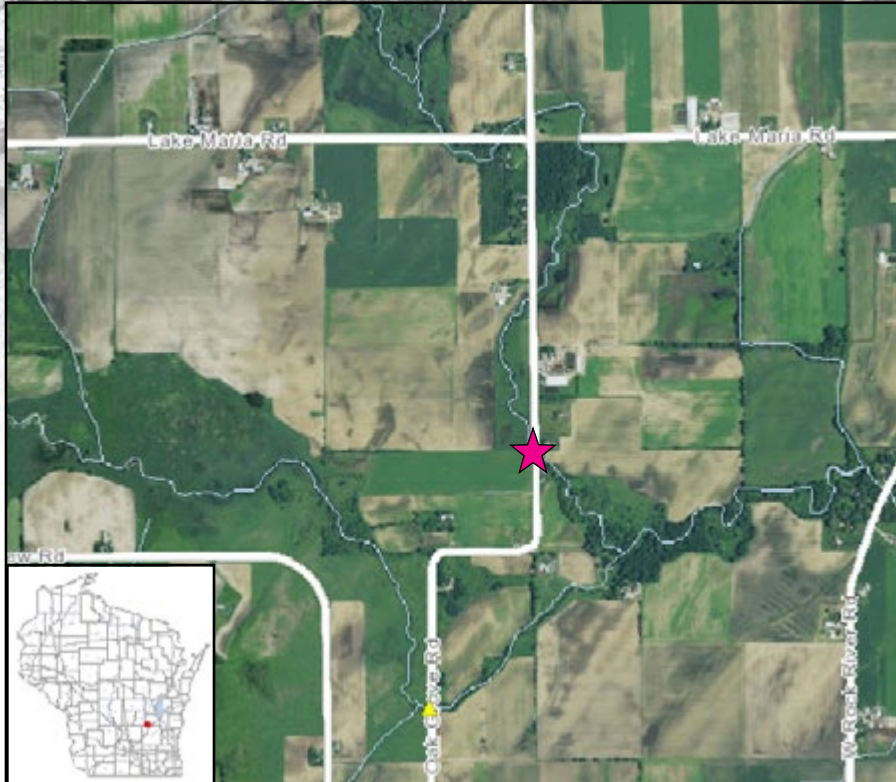
Map Legend - Sampling Location for 2015