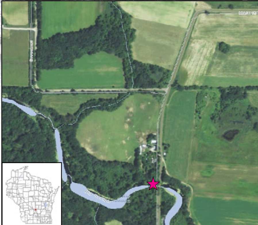
Map Legend ★ - Sampling Location for 2015