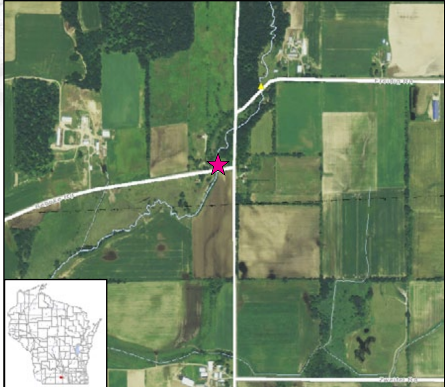
Map Legend ★ - Sampling Location for 2015