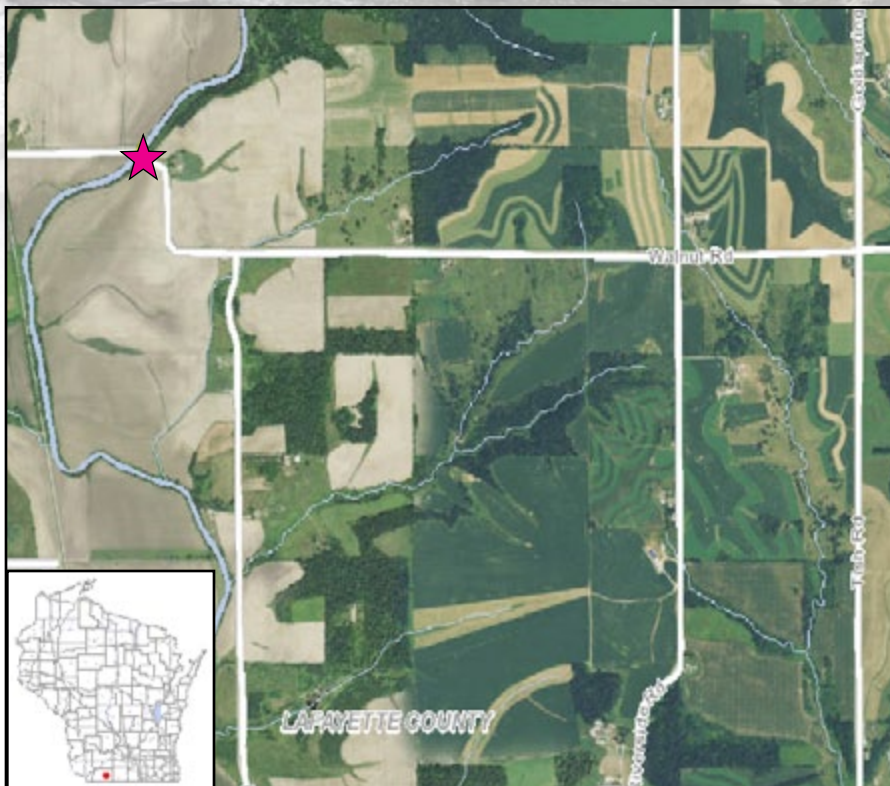
Map Legend ★ - Sampling Location for 2015