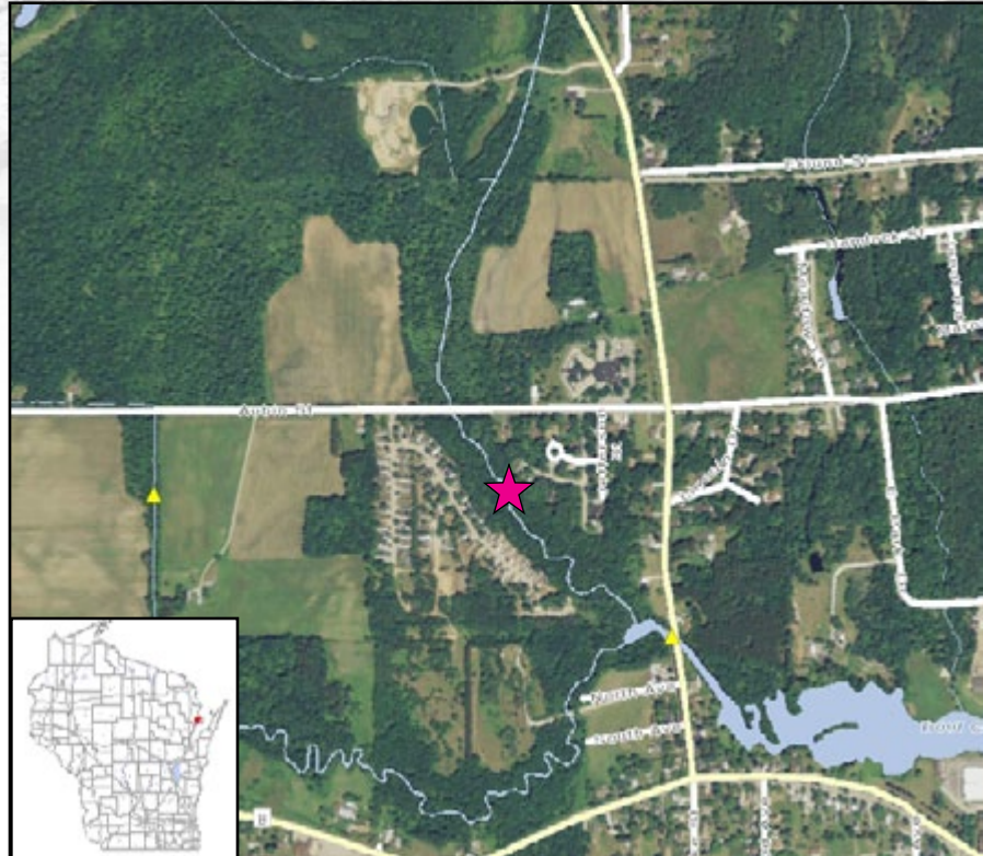
Map Legend - Sampling Location for 2015