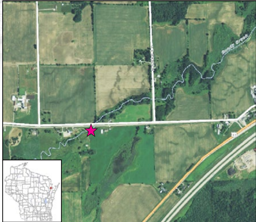
Map Legend ★ - Sampling Location for 2015