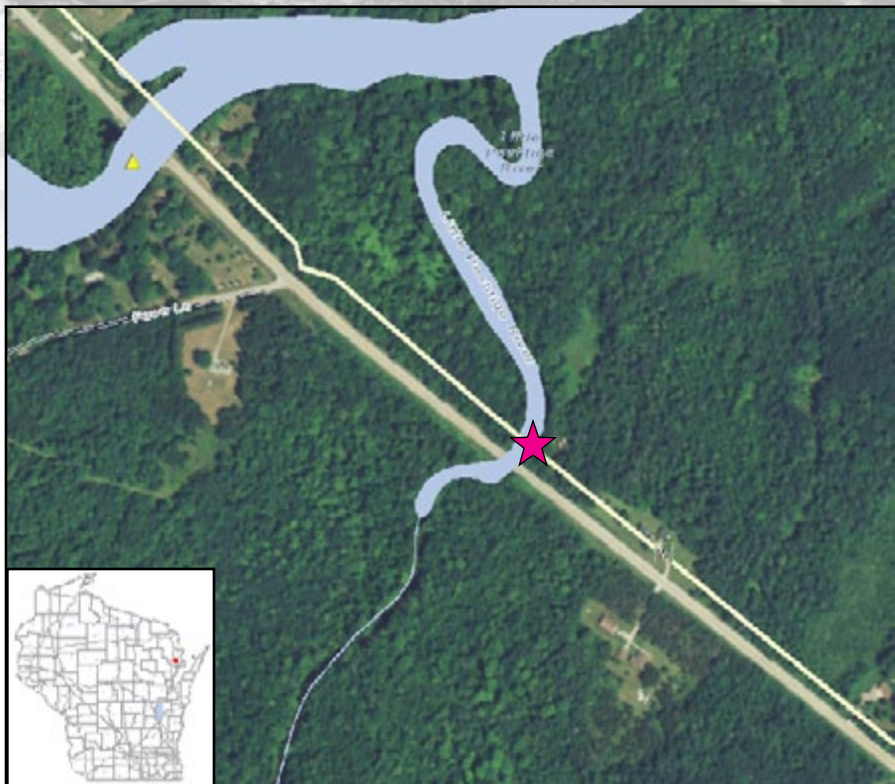
Map Legend ★ - Sampling Location for 2015