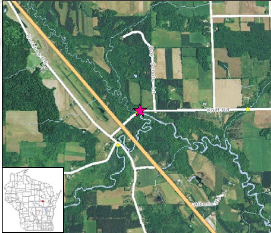
Map Legend ★ - Sampling Location for 2015