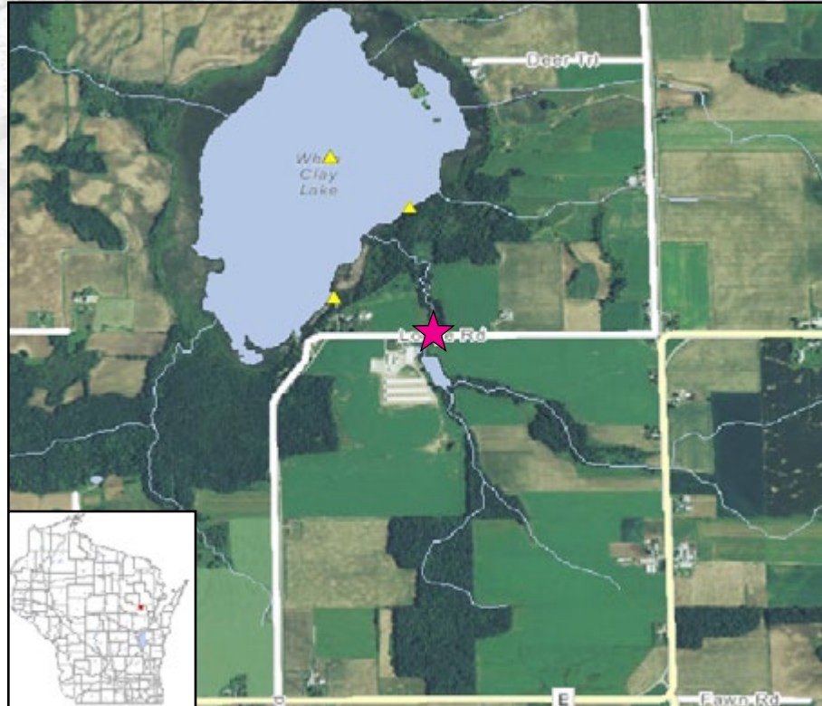
Map Legend - Sampling Location for 2015