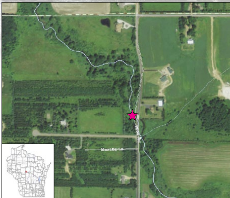
Map Legend ★ - Sampling Location for 2015