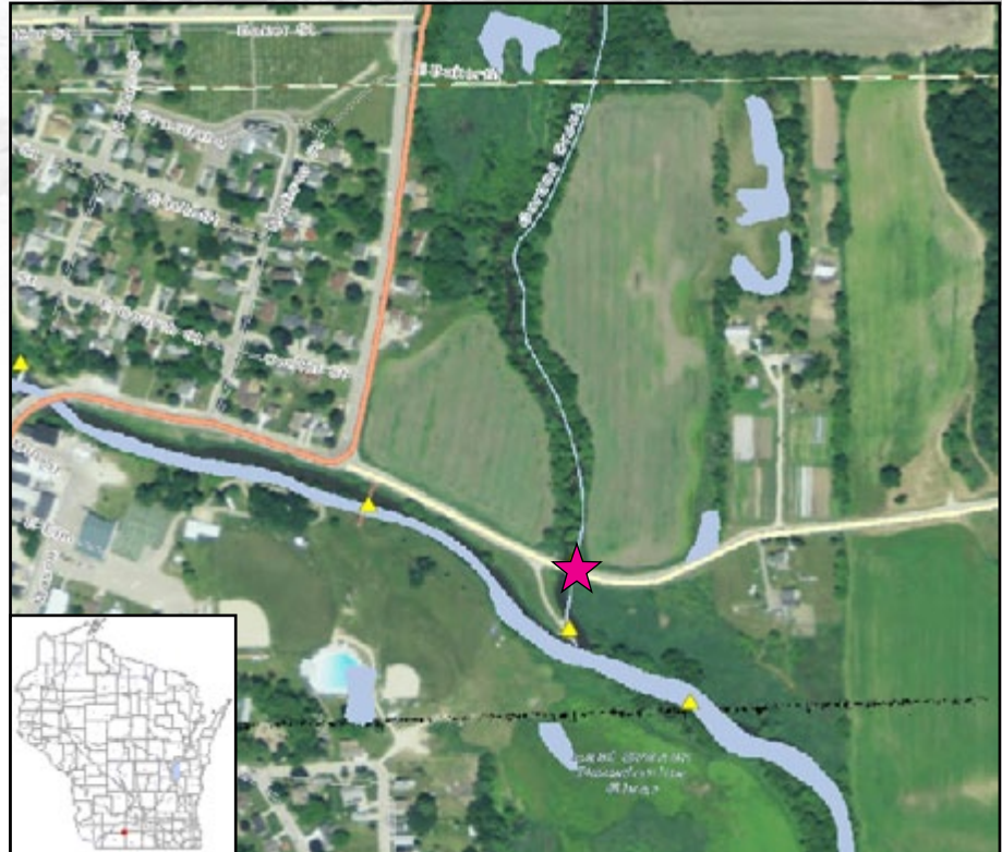
Map Legend ★ - Sampling Location for 2015