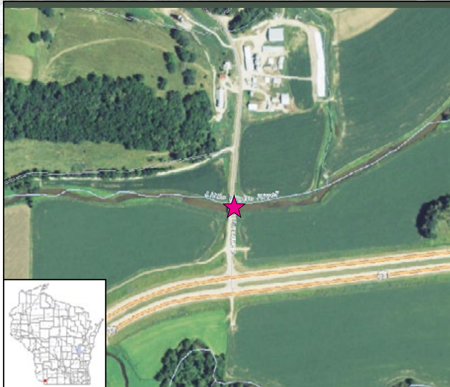
Map Legend ★ - Sampling Location for 2015