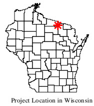
Project Location in Wisconsin