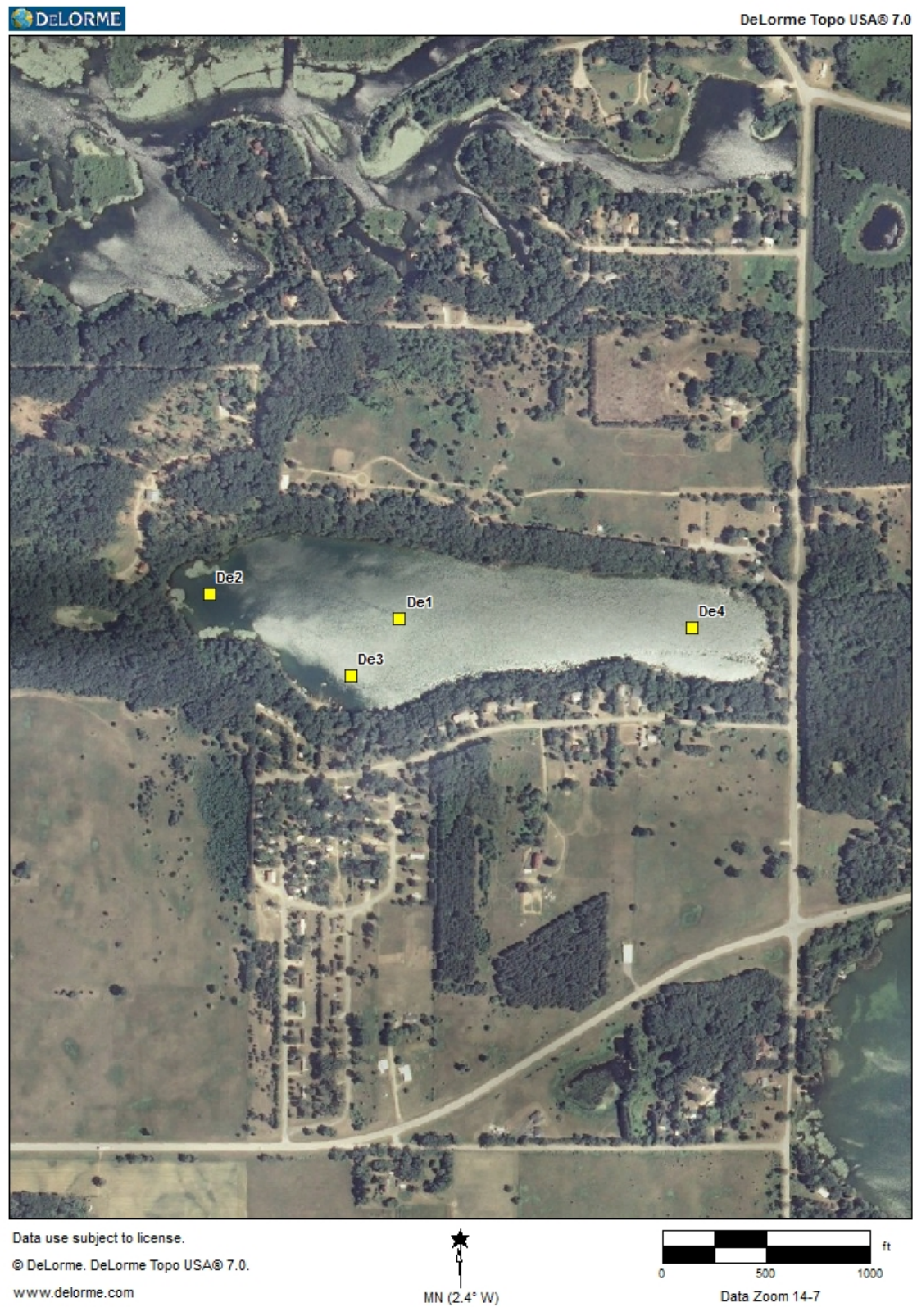
Figure 1. Deep Lake 2,4-D Treatment Areas 2013