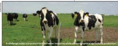
A challenge today is to protect land and water resources while achieving optimal agricultural production.