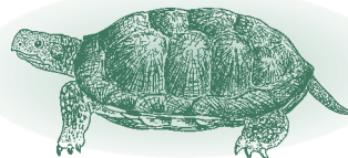
Wood Turtle - Threatened

Management plans for many forests identify areas where salvage logging may not be appropriate.