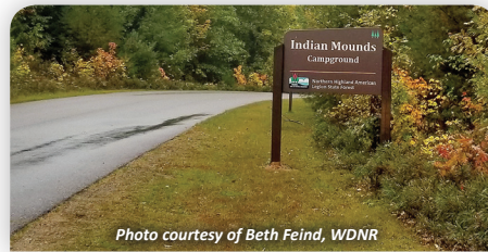
Entrance to Indian Mounds Campground.

Indian Mounds Campground , sites 1-39, are located in the southern portion of the forest on the northeast corner of Lake Tomahawk. Lake Tomahawk is part of the Minocqua Chain of Lakes and offers excellent fishing and boating. There is a boat landing and parking area near the entrance of the campground. Within the campground, the translucent waters at the sandy, updated beach attracts persons of all ages to enjoy the cool waters. Indian Mounds Campground derives its name from the four historic conical burial mounds built by the Woodland people many years ago. Camping reservations are required and can be made for the same day of your arrival or up to 11 months in advance of your planned date of occupancy. Campers must make a reservation before setting up on any site.