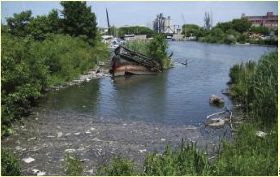
Clean up of the Kinnickinic River began in spring 2009