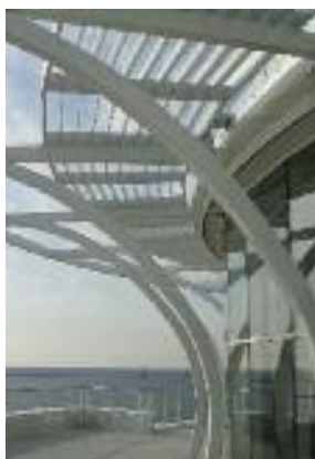
Pier Wisconsin, Milwaukee

Efforts are also underway at the local level to redevelop many Lake Michigan and Lake Superior waterfronts. Such sustainable development has brought economic value to many areas by providing outdoor recreational opportunities such as boating, hiking, biking and wildlife viewing opportunities, as well as decreased nonpoint source runoff which improves water quality.