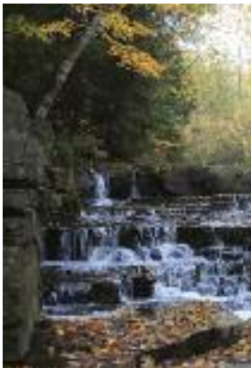
Devil’s River, Manitowoc County

One third of our state drains to the Great Lakes; one half of our population lives in this area. We have often tried to bend nature to meet our needs as we continue to develop our Great Lakes watershed. We have disrupted critical habitat and, in the process, lost or endangered many native plants and animals.