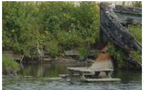
Testing shoreline stability