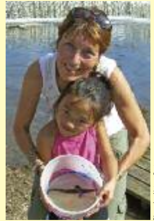
Riveredge Nature Center

The DNR has identified Lake Michigan tributaries as Lake Sturgeon Rehabilitation Waters. Thanks to the removal of dams, habitat restoration, and captive rearing and release, the lake sturgeon has returned to the Milwaukee and Manitowoc Rivers. This is a great success, but even more must be done to insure the survival of this magnificent creature.