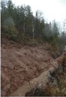
WDNR - Bureau of Forestry