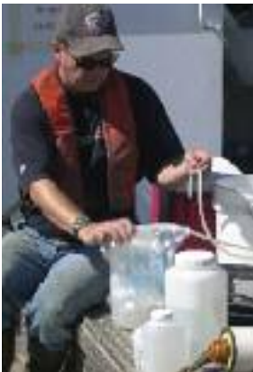
Collecting physical data on Lake Michigan