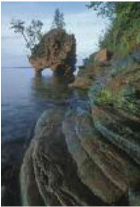
Apostle Islands, Lake Superior