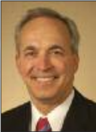
Secretary Matt Frank Wisconsin Department of Natural Resources

The rivers, streams, lakes and groundwater of the Great Lakes watershed are inextricably linked. The health of the Great Lakes is also directly linked to the regional economies that depend on them. This vast Great Lakes watershed is shared by two countries, eight states, two provinces and thirty nine tribal governments and inter-tribal organizations. We must work collaboratively and creatively at all levels across county, state and national boundaries for the protection and restoration of our Great Lakes.