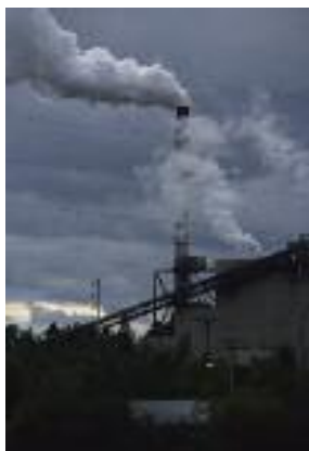
Air emissions contribute to water pollution