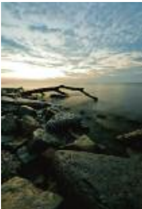
Sunrise over Lake Michigan from Milwaukee shore