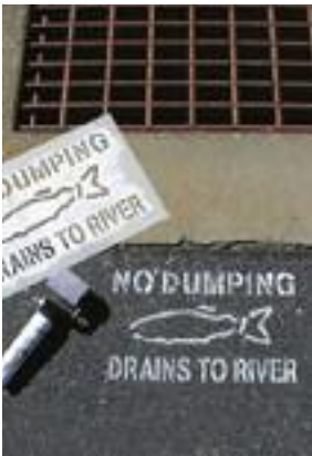
City of Menasha

Limiting the use of lawn fertilizers as well as yard and household chemicals, conserving water, and slowing the flow of water off the land are actions we can all take to prevent nonpoint source pollution.