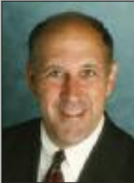
Governor Jim Doyle State of Wisconsin

The Great Lakes characterize Wisconsin. Their waters sustain our recreation, our way of life and our economy. From the majestic shores of Lake Michigan to the brutal and beautiful waters of Lake Superior, the Great Lakes are not just part of our heritage, but part of who we are. They have shaped our history, our cities, our industry, and our recreation. Just as they have formed this region, they will continue to help determine our future and our region's economic viability.