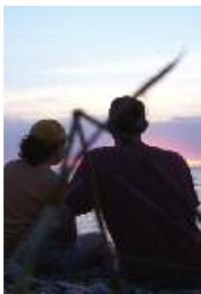
Enjoying a Lake Superior sunset