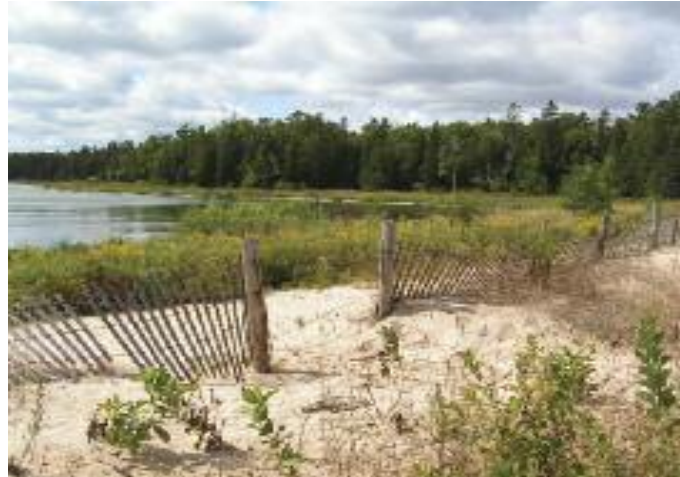
RIGHT: Cana Island, Door County