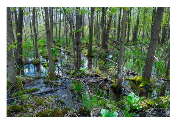
Example of Rare and High Quality Wetlands- Hardwood Swamp