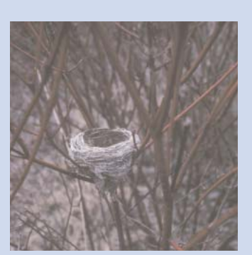
Red Osier Dogwood

Marsh milkweed has pink to magenta flowers and grows 1 to 4 feet tall. It prefers full sun and wet soils, tolerating an occasional flooding. Marsh milkweed is used by the monarch butterfly in all its life stages. Birds also use milkweeds when building their nests. Song sparrows line their nests with the fuzzy white "floss" from seed pods and Baltimore orioles use it in the construction of their hanging nests.