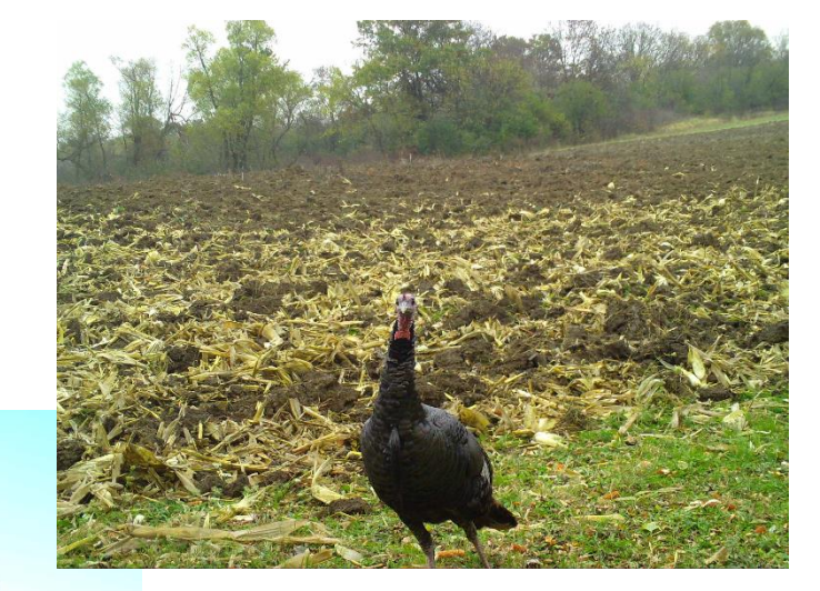
← Example of Southern Wisconsin Till Plains habitat

Turkey captured on Snapshot Wisconsin camera in Racine County →