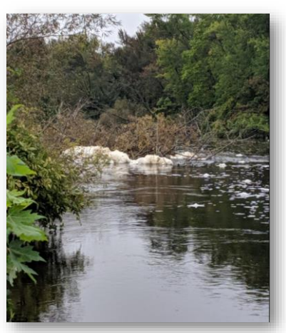
Foam on Peshtigo River