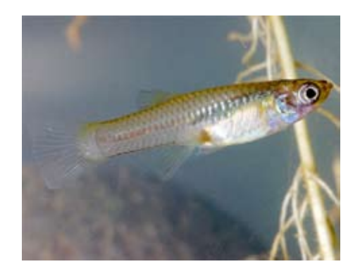
Mosquitofish, Gambusia affinis

Bait and forage fish are imported into Wisconsin for various reasons. Shipments of bait and forage fish can be a vector for the incidental or accidental introduction of prohibited invasive fish species. Chapter NR 40 of the Wisconsin Administrative Code provides that all non-native fish species are prohibited unless they are not viable in Wisconsin, or are named in Chapter NR 40 in lists of established non-native species, non-native fish species in the aquaculture industry, or non-native fish species in the aquarium trade. Prohibited fish species that may be incidentally or accidentally imported in bait and forage fish shipments include mosquitofish and Asian carp.