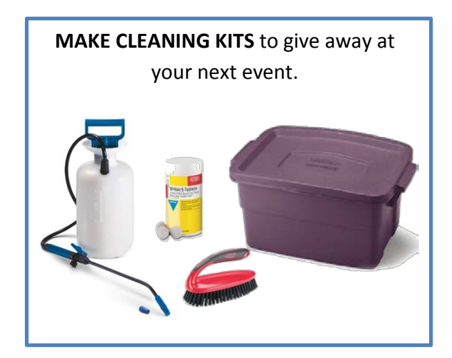
Cleaning kits can include a scrub brush, sprayer, Virkon packets and soaking tub