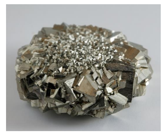
Arsenic-rich minerals, such as arsenic-rich pyrite (pictured), are natural sources of arsenic in groundwater in Wisconsin.

In northern Wisconsin sulfides and arsenopyrite can be found in the Precambrian granitic bedrock, and arsenic bearing iron oxides can be