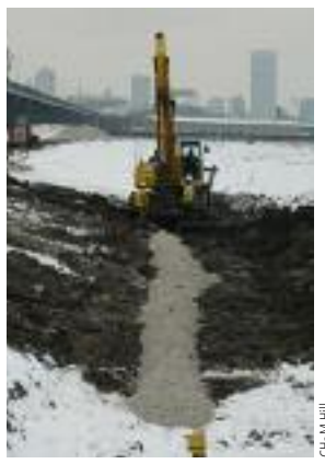
Removing toxic sediment