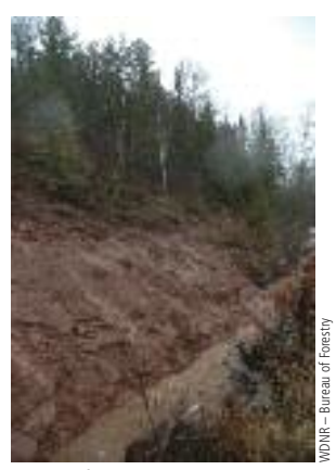
Erosion of stream bank in the Lake Superior watershed