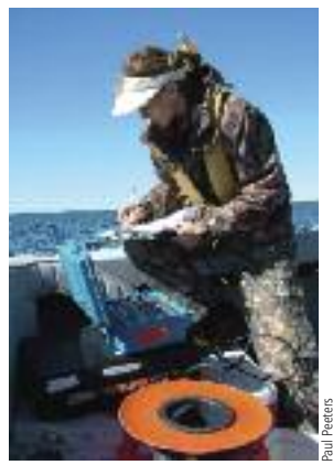
Collecting physical data on Lake Michigan