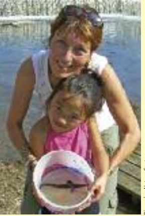
Volunteers release captive-raised sturgeon