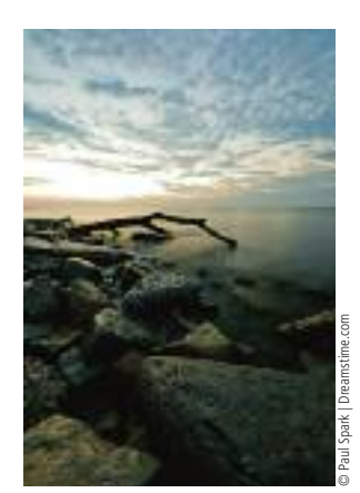
Sunrise over Lake Michigan from Milwaukee shore