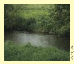
Do you know of stream banks that could benefit from buffers? CREP may be able to help.

The benefits from the program are many. The program is estimated to reduce annual phosphorus and nitrogen loading by 600,000 and 300,000 pounds a year, respectively, and reduce sediment loading to streams by over 330,000 tons a year. Critical northern pike spawning habitat benefits from lower sediment loads to riparian wetlands. The buffers also provide cover for birds and animals.