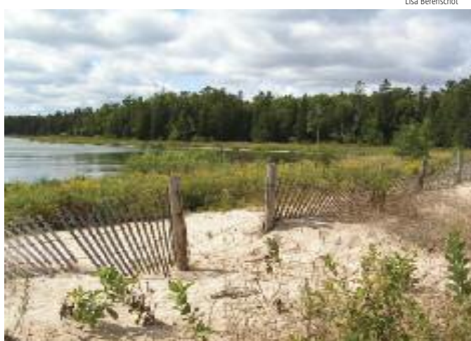
RIGHT: Cana Island, Door County