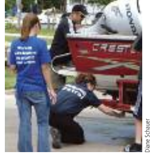
Clean Boats, Clean Waters volunteers check boats and trailers

Great Lakes ecosystem and its fisheries could be seriously threatened.