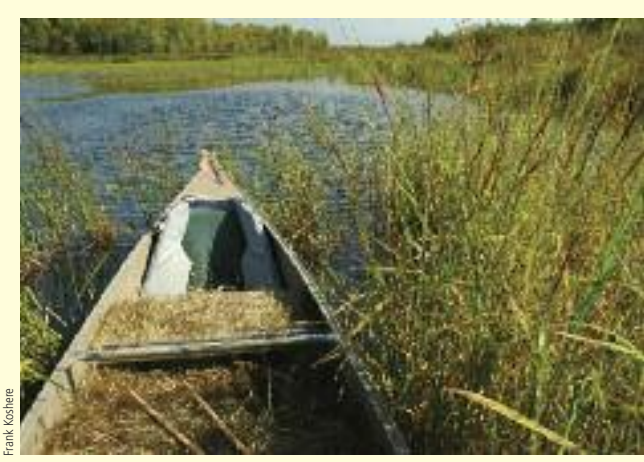
Wild rice on the St. Croix River