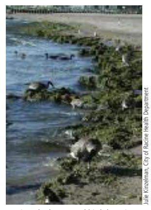
Rotting algal mats and bird droppings contribute to bacterial contamination

Miles of beautiful Great Lakes beaches are a tremendous recreational asset we can all enjoy. Providing natural swimming opportunities to populous Milwaukee or solitary beach walking opportunities at Wisconsin Point in Superior are just two experiences beaches add to Wisconsin's quality of life. When our beaches are closed due to high bacteria counts or accumulation of algae, we lose access to Lake Michigan and Lake Superior, we lose tourism dollars. and we lose our connection to these inland seas