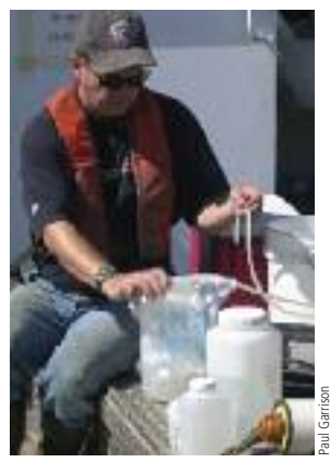
Analyzing water samples from Lake Michigan

The five Great Lakes and the St. Lawrence Seaway function as one huge ecosystem. Their waters, watersheds, estuaries, tributaries, wetlands and groundwater are inextricably connected. To be effectively managed, these vast resources must be treated as one ecosystem. Add to this the fact that management of the Great Lakes is shared between eight states, two Canadian provinces, two federal governments, thirtynine tribal governments and intertribal organizations, and a multitude of local municipalities and organizations, and you can imagine how critical – and how difficult - data collection and management can be.