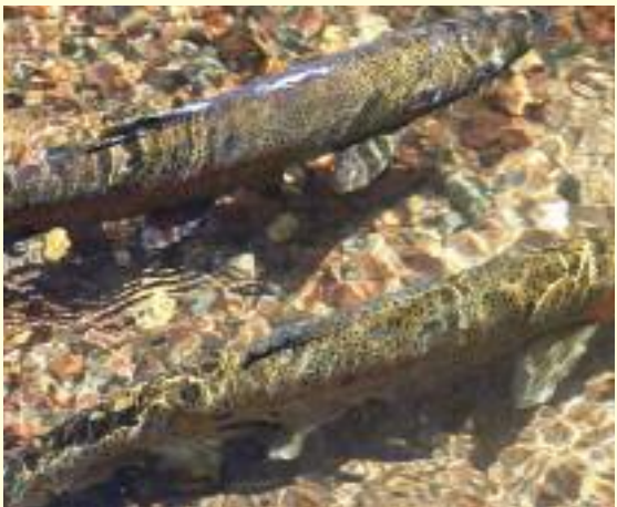
Trout and other fish accumulate PBTs in their tissues