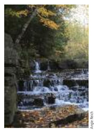
Devil's River, Manitowoc County

" To keep every cog and wheel is the first rule of intelligent tinkering."