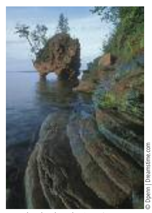
Apostle Islands, Lake Superior

This is an exciting and hopeful time for the Great Lakes! Earth's largest freshwater system has finally been identified as a national management priority.