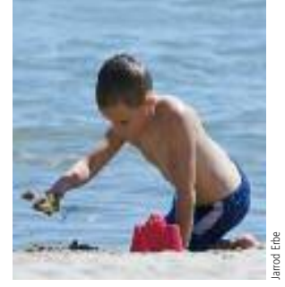
Fun on the beach, Sheboygan

The Wisconsin DNR and state citizens have worked with Governor Doyle to tailor this regional action plan for Wisconsin. The "Wisconsin Great Lakes Restoration and Protection Strategy" is a road map for state legislators, resource managers, local government officials and Wisconsin's citizens for the protection of Lake Superior and the restoration of Lake Michigan.