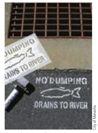
Storm drain stencil, Menasha

RIGHT: Runoff from construction sites can end up in streams and lakes