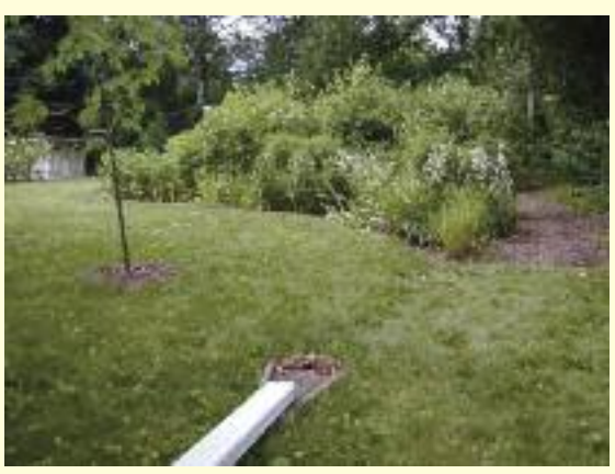
Directing storm water to lawns and gardens reduces runoff