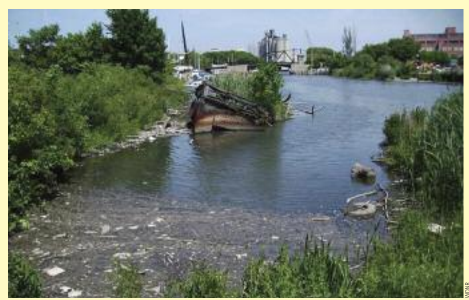
Clean up of the Kinnickinic River began in spring 2009

For more information, visit: dnr.wi.gov/org/water/wm/sms/kkriver/