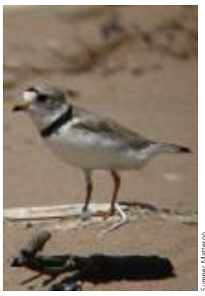
The endangered piping plover depends on healthy beach habitat