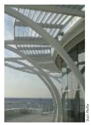
Pier Wisconsin, Milwaukee

People love to be on or near the water. This love translates into rapidly escalating land values for waterfront property for both new development and redevelopment projects, plus conflicting land use pressures for the available land. Given this trend, how do we incorporate the concept of sustainable development practices into current activities?