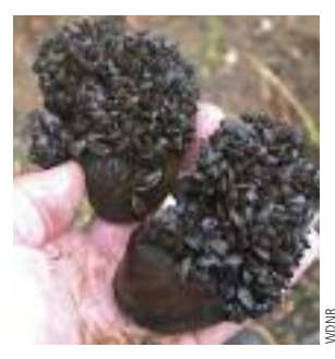
Zebra and quagga mussels