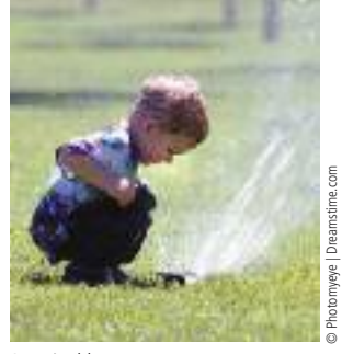
Sustainable water use supports current needs and those of future generations

Wisconsin's Great Lakes Basin Water Management Program, based on the Compact and state implementing legislation, calls for: