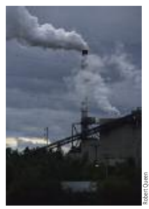
Air emissions contribute to water pollution

" If the Bill of Rights contains no guarantee that a citizen shall be secure against lethal poisons distributed either by private individuals or by public officials, it is surely only because our forefathers, despite their considerable wisdom and foresight, could conceive of no such problem."